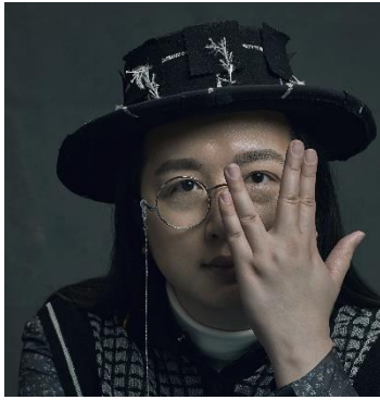
Audrey Tang Government of Taiwan Cyber Ambassador-at-large and 1 st Digital Minister (2016-2024)